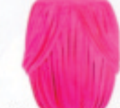
BLESSED ARE THE MEEK draped skirt, $10995 (02 9303 5883)