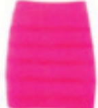
BARDOT bandage skirt, $4995 (www.bardot.com.au)