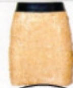
VALERIE TOLOSA sequined skirt, $176 (02 9332 2369)