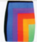
HOTEL rainbow skirt, $70 (02 9390 1501)