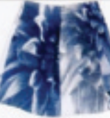
MAURIE & EYE printed skirt, $179 (02 9997 4634)