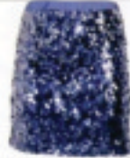
ALIBI sequined skirt, $4995 (www.alibibrand.com.au)