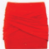
BACKSTAGE red skirt, $80 (02 9790 0522)