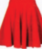
LINEDBOP red skirt, $132 (www.linedbop.com.au)