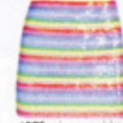
ASOS rainbow sequined skirt, $42.25 (www.asos.com/uk)