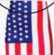
BLACK MILK USA flag skirt, $60 (www.blackmilkclothing.com)