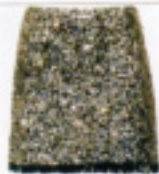
EBONY EYE sequined skirt, $290 (www.dorings.com.au)