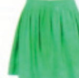
MISTER ZHI suede skirt, $795 (www.misterzhi.com)