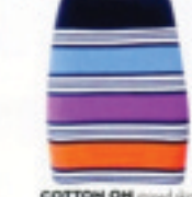
COTTON ON striped skirt, $995 (03 5277 7000)