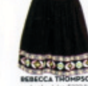
REBECCA THOMPSON embroidered skirt, $222.50 (www.rebeccathompson.com.au)