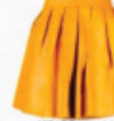
YORABO mustard skirt, $2595 (www.yorabo.com)