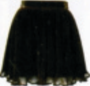
HINKY MEETS HINKY skirt, $79 (02 9380 6849)